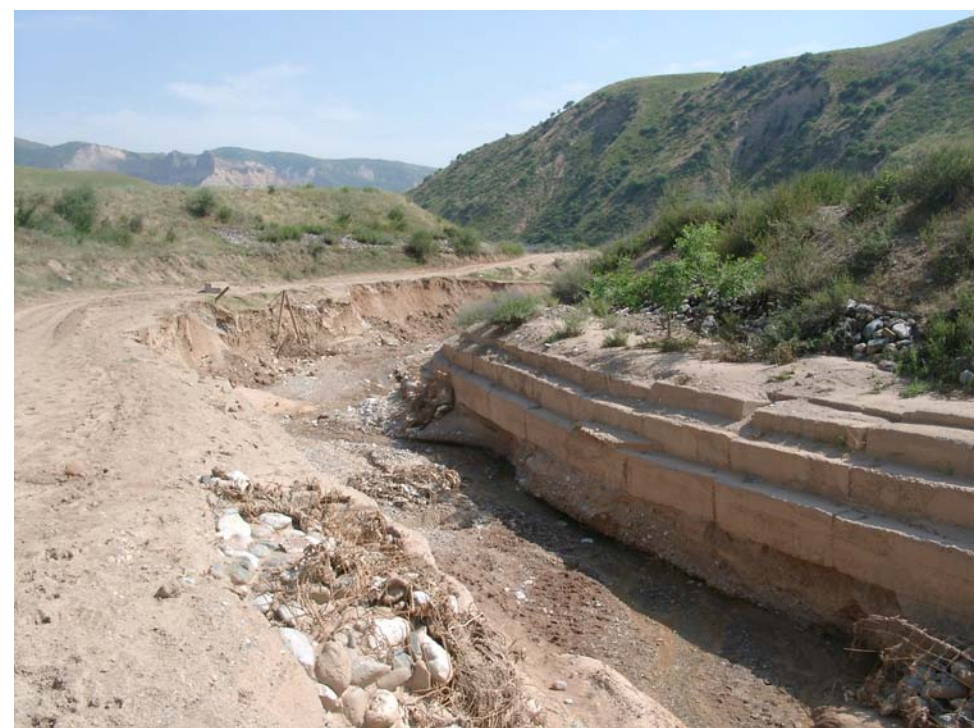
FIGURE 1. Fluvial erosion of the dam toe of tailings pond no. 2 and 13 in the valley of Aylampa Sai, a tributary of the Mailuu Suu river.

While erosion does not lead to a critical radiological impact today (i.e., incremental effective doses due to the mining and milling residues stay far below 1 mSv/a), it is the uncontrolled nature of the dispersion of radioactive mining and milling residues and the unpredictable accumulation of radioactive material on floodplains downstream which causes strong concerns. The transboundary nature of fluvial dispersion may also lead to political strains with neighboring Uzbekistan.